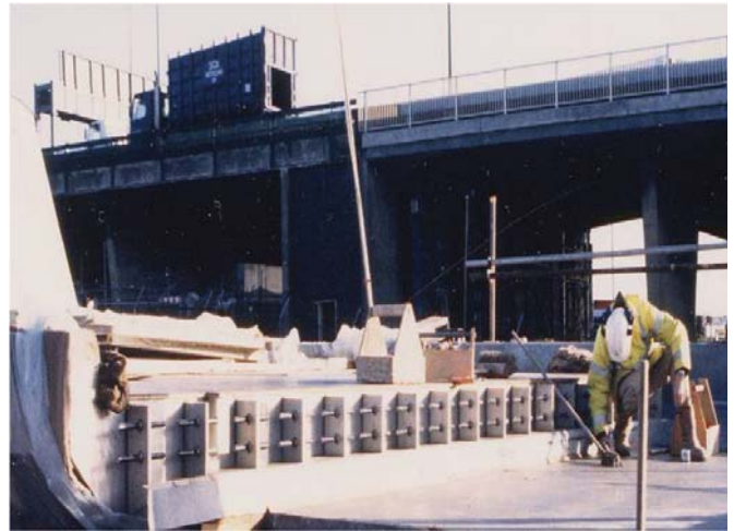
Stainless steel deck joints were installed in the Dartford River Crossing to counter the corrosive effect of de-icing salts