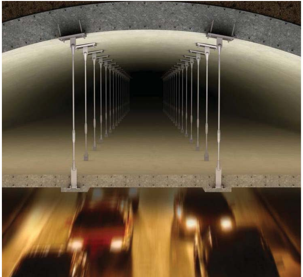
The North-South Bypass in Brisbane is Australia's longest road tunnel

Stainless steel is available in a range of alloys and product forms and can meet the most arduous conditions. It requires no added protection for corrosion resistance and its high strength and fire resistance properties provide a long and durable service life, with little or no maintenance. Tunnel engineers deploy stainless steel in both visible applications, such as fire doors and barriers, and invisible applications such as reinforcing.