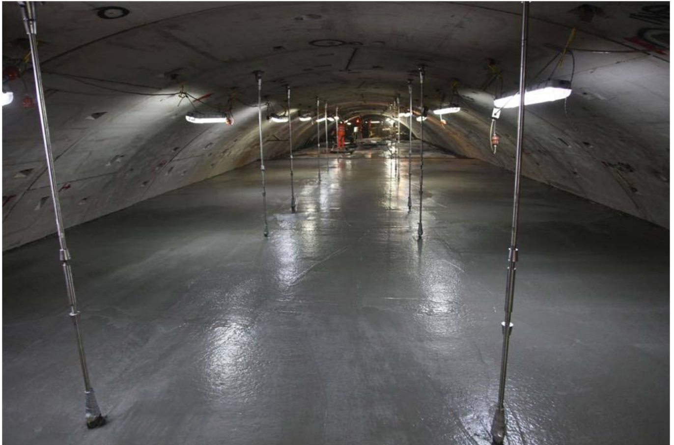
Brisbane's North-South Bypass uses 33,000 light gauge stainless steel posts as lining supports in a highly corrosive atmosphere

The longest road tunnel in Australia is the North-South Bypass (also known as the Clem Jones Tunnel or CLEM7) in Brisbane. Comprised of two 4.8 km twin-lane tunnels, CLEM7 has been built under the Brisbane River. Duplex stainless steel (EN 1.4462/ASTM-UNS S32205/S31803) was specified for use throughout the tunnel due to its ability to withstand the highly corrosive environment. Applications included the use of 33,000 light gauge stainless steel posts as tunnel lining supports.