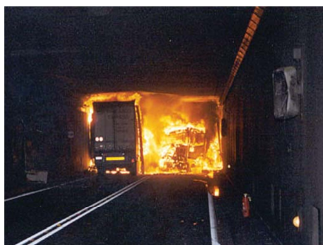
Fires in road tunnels can cause catastrophic damage to people and tunnels

Solutions to prevent or minimise the devastating effects of road tunnel fires inevitably use stainless steel. This is due to its excellent performance at the elevated temperatures generated by hydrocarbon fires.