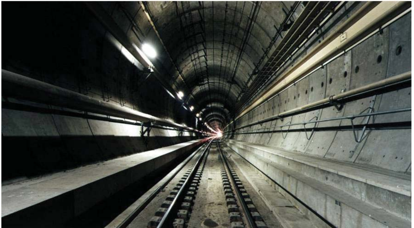
View inside one of the running tunnels

throughout the Tunnel, must remain fully functional at a temperature of 1,000°C. Using grade EN 1.4401/AISI 316 for their construction ensured they achieved this target in compliance fire tests.