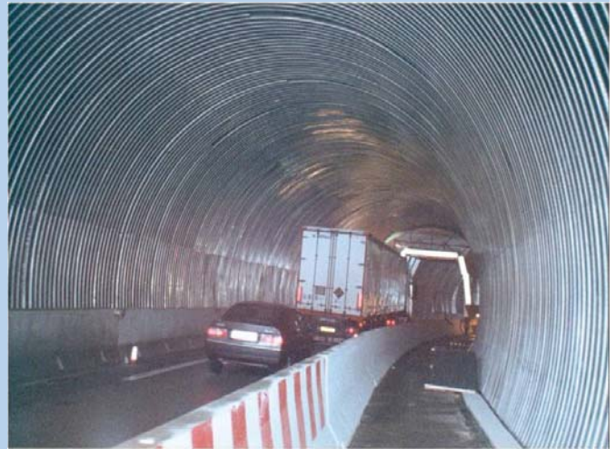
Over 12,000 m 2 of stainless steel mesh protects traffic from spalling concrete

On the A10 (Genoa to Savona) alone, 25 tunnels have required extensive repairs to stop spalling concrete falling onto the motorway. Over 12,000 m 2 of stainless steel mesh (EN 1.4401/AISI 316) has been used to line the tunnels. The mesh catches any falling lumps of concrete and directs them away from the road surface.