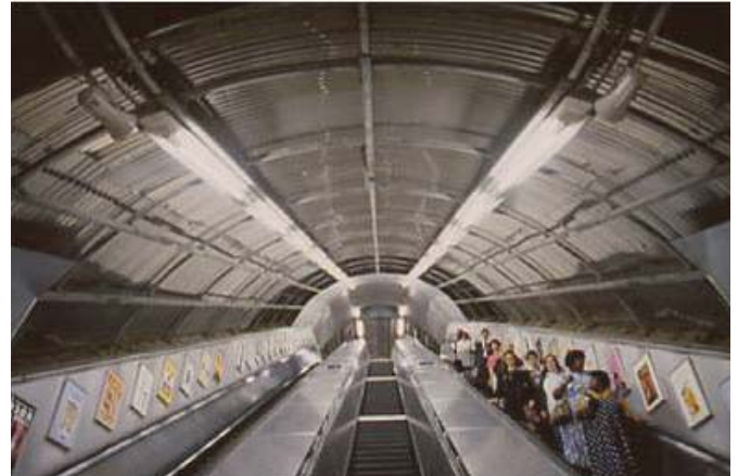
London's Underground network has 270 stations and relies on stainless steel to keep people moving - and safe!

Stainless steel was extensively used in the tunnels and stations of London's Jubilee Line when it was extended to the revitalised docklands area to the east of the capital.